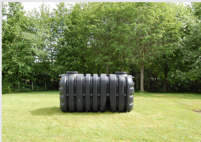
Lightweight and easy to handle.