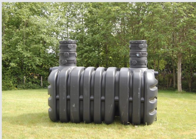
Tricel Vento with risers.