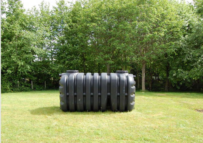
Lightweight and easy to handle.