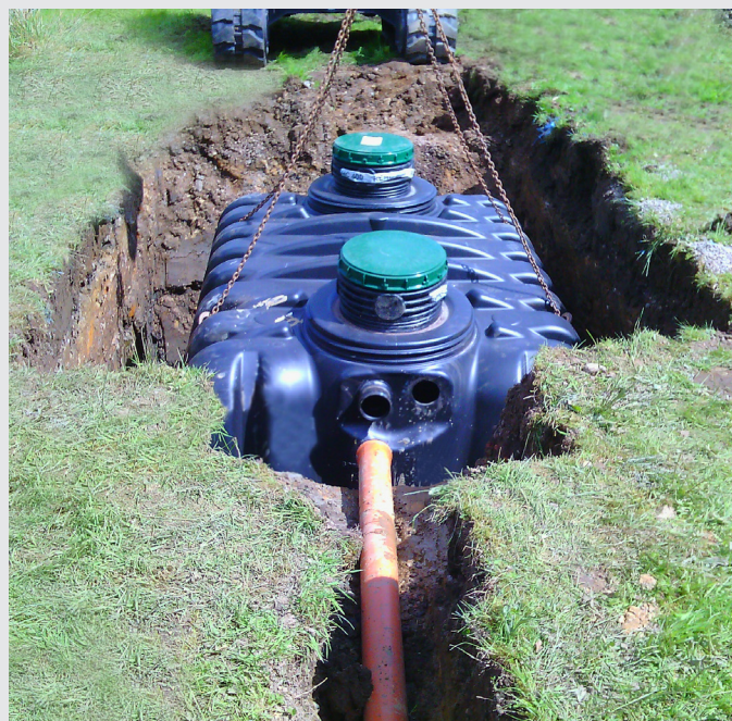
Tricel Vento installed.