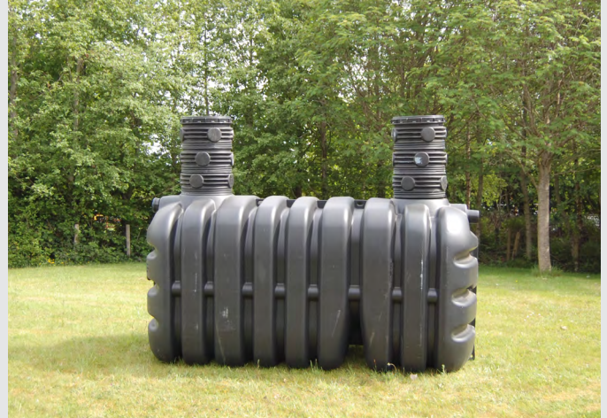
Tricel Vento with risers.